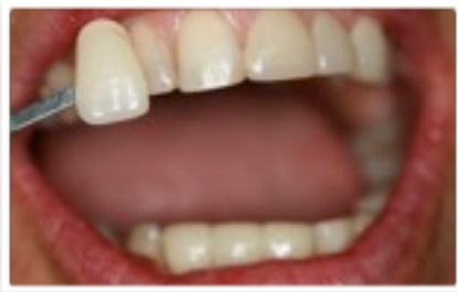
[ Acrylic temporaries ]

First, we designed everything in wax and then fabricated temporary restorations based on our design. After a short period of the patient wearing the temporaries, we fabricated the final restorations.