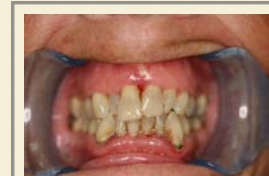
This red band is the tissue response to the bacteria that is present in the plaque and calculus that is readily visible on the teeth surfaces