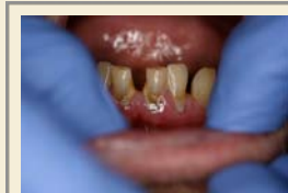
A dark red band is present next to the teeth