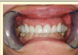
Notice how there is no plaque or calculus present and no red band or bleeding of the tissue

Studies in the last fifteen years have shown links between periodontal (gum) disease to heart disease and to complications with diabetic patients. The blood supplies in the oral cavities have a direct influence on the systemic blood system and infections.