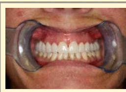
The tissue is pink and firm looking with a stippled look to the surface