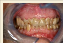
The tissue is red, shiny, smooth and appears swollen